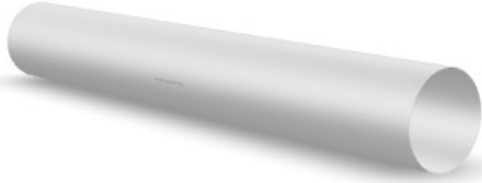
Dowel Bar Sleeves