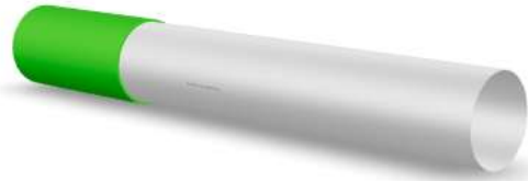
Dowel Bar Caps